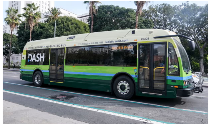
An electric bus in Los Angeles, California.

Mining lithium is a fraught business, and the rise in demand for EVs is contributing to a rise in social and environmental harms – and global supply chain bottlenecks.