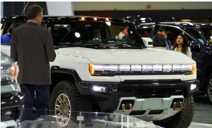
The GM Hummer EV at the North American international auto show in Detroit, Michigan, in September 2022.

"The report brings into light possibilities for a future without fossil fuels that minimizes mineral extraction and new harms to communities in lithium-rich areas," said Pia Marchegiani, policy director at the Environment and Natural Resources Foundation in Argentina.