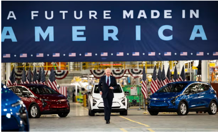
Joe Biden at the GM Factory Zero in Detroit, Michigan, in November 2021.

By 2050 electric vehicles could require huge amounts of lithium for their batteries, causing damaging expansions of mining