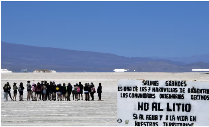
✪ A sign against the exploitation of lithium is seen as tourists visit the Salinas Grandes salt flat.

Lithium mining is, like all mining, environmentally and socially harmful. More than half the current lithium production, which is very water intensive, takes place in regions blighted by water shortages that are likely to get worse due to global heating.