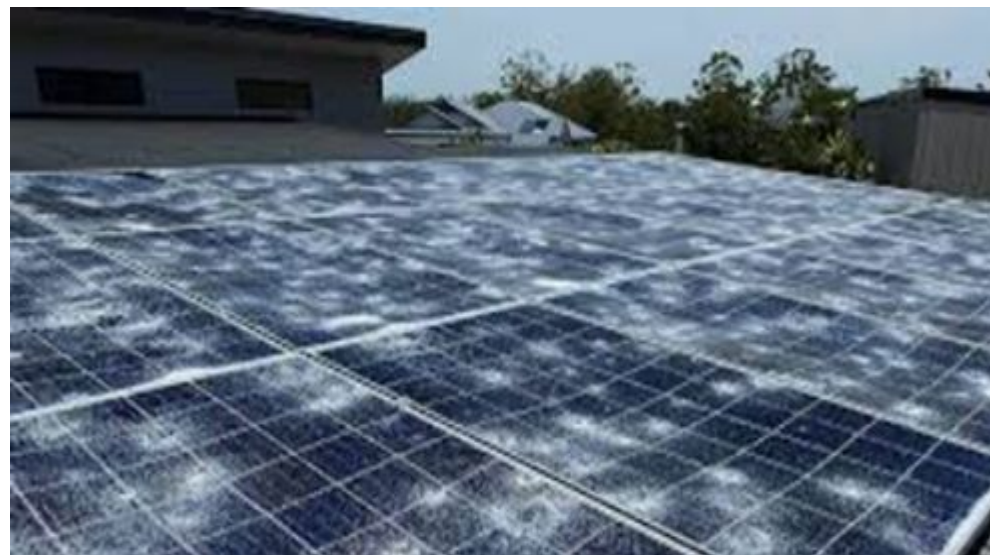
HAILSTONE DAMAGED CONVENTIONAL PANELS

** Information sourced from solar panel data sheets