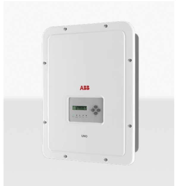
ABB string inverters UNO-DM-1.2/2.0/3.0-TL-PLUS 1.2 to 3.0 kW